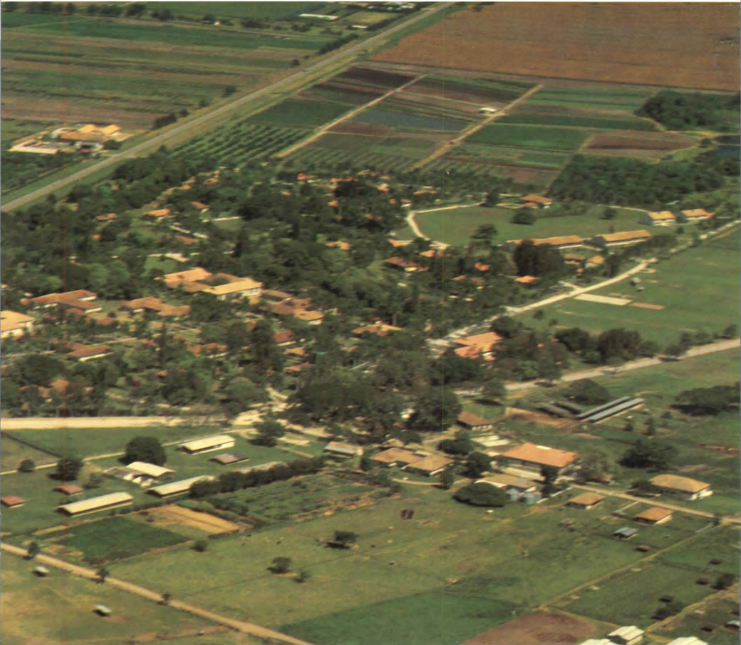
ZAMORANO'S CAMPUS IS LOCATED IN THE PICTURESQUE YEGUARE VALLEY OF HONDURAS.

The School's Board of Trustees, composed of distinguished United States and Latin American citizens, sets policy for the institution. The Board is committed to making a superior private college education available to greater numbers of Latin youth and ensuring that future generations can benefit from Zamorano's emphasis on teaching initiative, strong work ethic and free market opportunities.