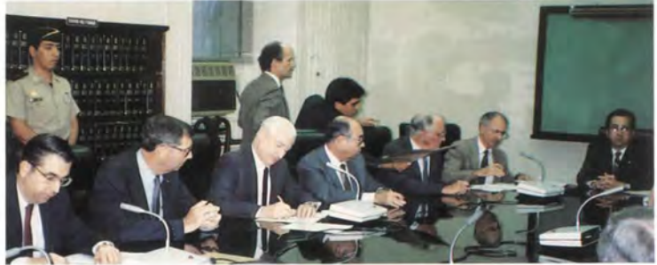
U.S., HONDURAN AND ZAMORANO OFFICIALS SIGN THE ENDOWMENT AGREEMENT AT THE PRESIDENTIAL PALACE IN NOVEMBER 1988.

This new endowment will assist Zamorano in strengthening the present program and building toward a more financially secure future.