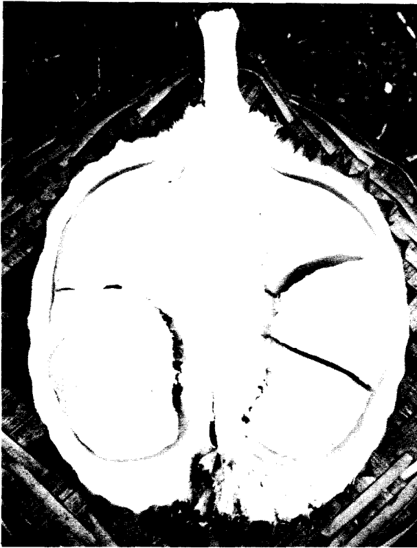
FIGURE 4.—Interior compartments of durian fruit, showing uniform arils.

responds to the funiculus and to the side of the aril facing the central core of the fruit. On one side of the seed there is a large, light-colored hilum that in some cases occupies one-third of the seed surface. The seed is also enveloped with two papery seed-coats or reddish-brown integuments. Fruits with attractively colored arils are usually displayed in the markets of Thailand with a window cut in the capsule to expose them to the passers-by, but they are carefully wrapped in cellophane to protect the shiny pulp from dust and dirt.