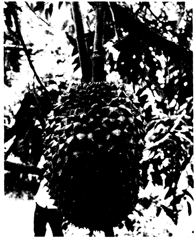
FIGURE 6.—Large fruit of the cultivar 'Chanee' (approximately 30 cm long).