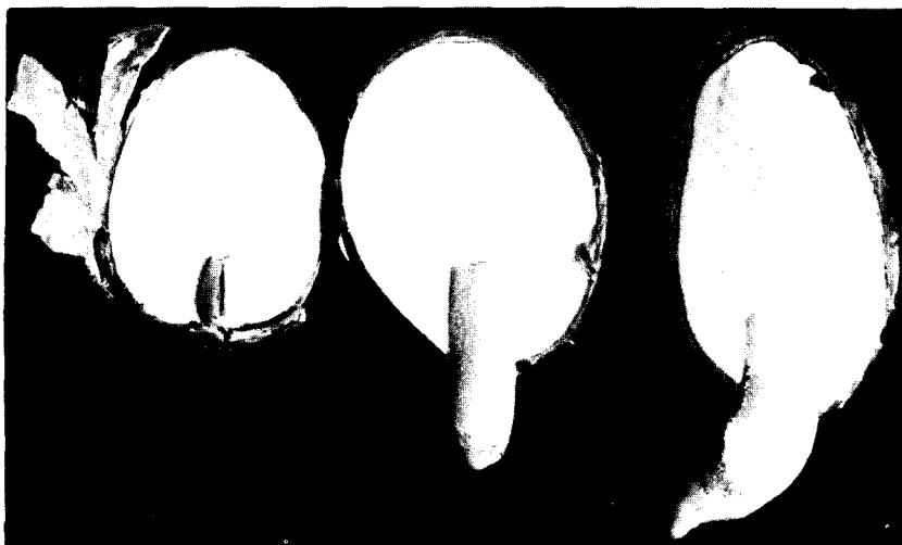
FIGURE 3.—Durian seed (actual size).

Each of the five interior compartments of the capsule has smooth walls and contains one to six seeds 2 to 6 cm long. The seeds are larger in unselected types and smaller in improved cultivars (fig. 3). A fleshy, edible aril completely surrounds each seed (figs. 4 and 5), especially if the seeds are abortive, small, and rudimentary, as in the good cultivars. Seed color is usually creamy, but colors range from light to dark tones, sometimes a distinct light orange, which is preferred by most people. Directly above the large hilum patch of the seed, the aril is mealy and lighter in color (8). This area cor-