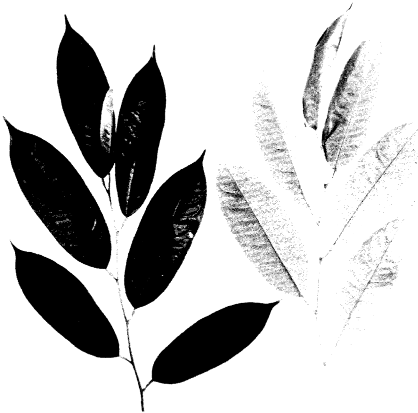
FIGURE 1.—Durian leaves.

Durio zibethinus Murr. is a medium to large tree, depending on soil depth and fertility, which grows up to 40 m in some unusual cases in the forest. However, grafted orchard trees seldom grow over 12 m, more commonly 8 to 10 m. The leaves are simple, alternate, leathery in texture, elliptic to oblong, 8 to 20 cm long, with a characteristic silvery-brown or rusty undersurface scurfy in texture and a light-green, smooth, upper surface (fig. 1). The foliage is peculiarly attractive, changing color and texture with the breeze much in the same