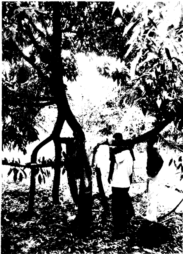
FIGURE 9.—Inarches made to prolong the life of the main trunk of a durian tree infected with Phytophthora palmivora (Butl.) Butl. Note the graft union in the main trunk with a slight overgrowth of the scion.

Perhaps, the juvenility of the seedling conveys a