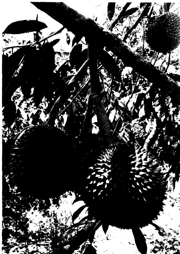
FIGURE 7.—'Kanyao', or 'Karn Yao', durian fruit. This cultivar has perhaps the longest peduncle (15 cm or more) of any commercial Thai cultivar.

The main bloom in Malaysia and Thailand extends from November through the early part of March, depending on the location, because this region covers almost 18° of latitude from Singapore (0°) to