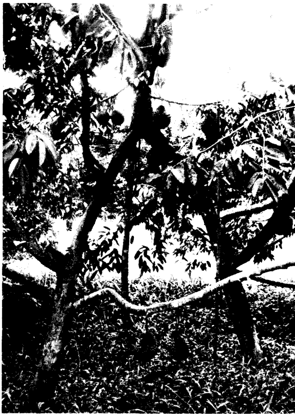
FIGURE 10.—Durian tree that has lost its main trunk and is supported by the stems of three inarches.

There has been some testing for tolerance involving other species of Durio . Results of laboratory experiments show that roots of Durio malaccensis Planch. (13) and possibly Durio mansoni (Gamble) Bakh. (27) do not attract zoospores of Phytophthora palmivora (35). This tolerance has to be confirmed in field experiments in infested soils. Both of these species of Durio seem to be graft compatible with the durian.