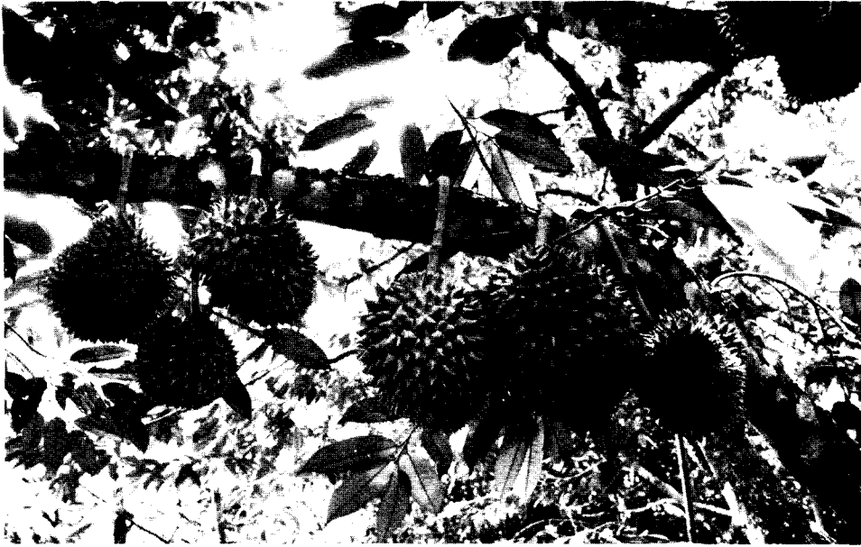
FIGURE 8.—Branches so heavy with fruit that they must be propped with bamboo stakes to prevent breakage.