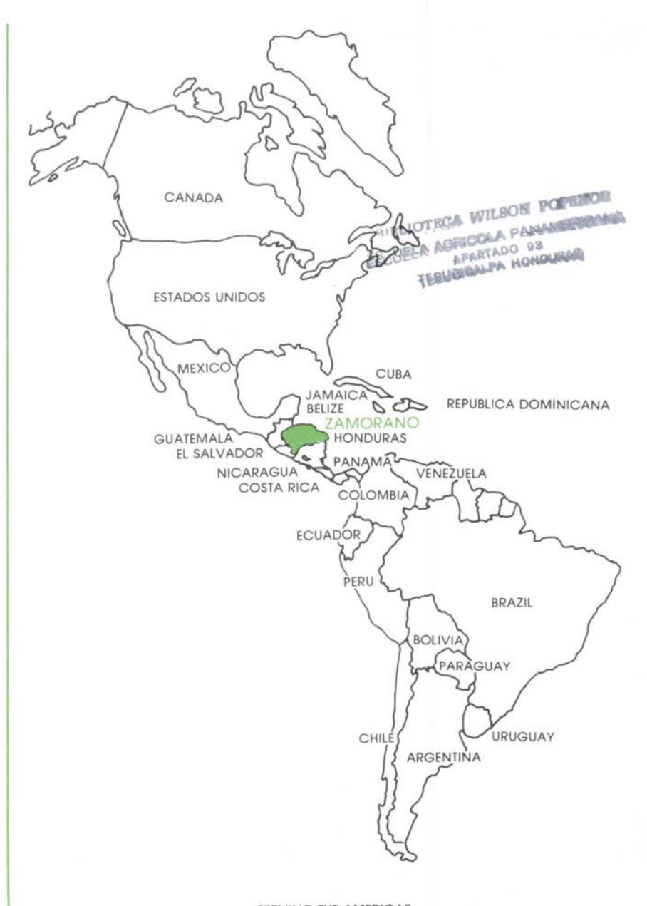
SERVING THE AMERICAS AL SERVICIO DE LAS AMERICAS