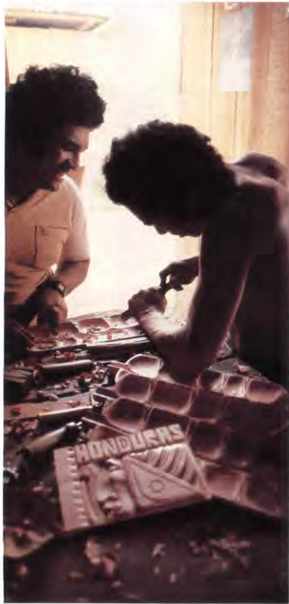
Honduran woodworking enterprise, with help from Aid to Artisans (ATA), generates employment for Honduran craft workers. In one notable example, ATA works with the Fundacion Hondureño de Rehabilitación e Integración de Limitados (FUHRIL) to teach handicapped persons various crafts and thus integrate them into the Honduran economy. Peace Corps volunteers serve as designers and supervisors in conjunction with many ATA enterprises.

Aid to Artisans (ATA), the private voluntary organization that administers the project, identifies craft and folk art pieces that are best suited to U.S. markets and are most representative of the indigenous culture. ATA then assists in their importation and distribution in the U.S. (now duty-free under the CBI program). In some cases, ATA has given grants to craft groups and cooperatives for tools, equipment and raw materials—and then provided advice on product design and marketing.