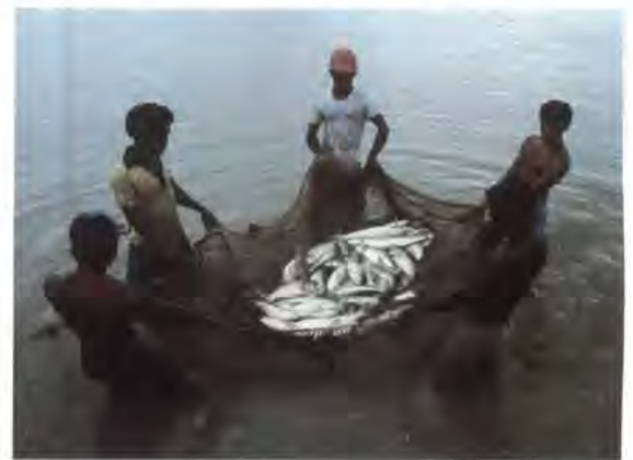
AID-funded aquaculture project is a source of protein and income for Panamanians. (AID)

The Caribbean island nations, Central America and the United States are more than just neighbors. They are dependent upon one another for economic growth, security and prosperity. The security and well-being of the countries of the Caribbean and Central America are vital to the United States and to the Western Hemisphere as a whole.