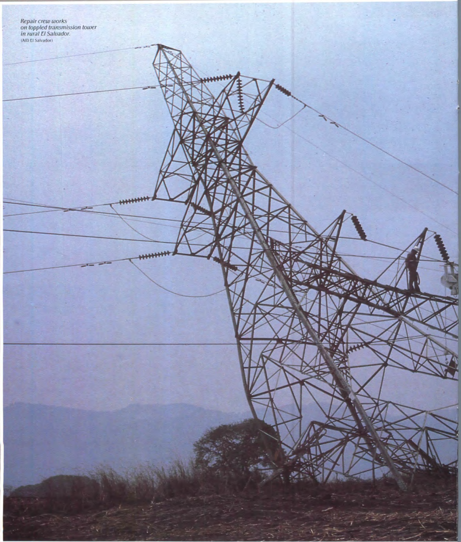
Repair crew works on toppled transmission tower in rural El Salvador.