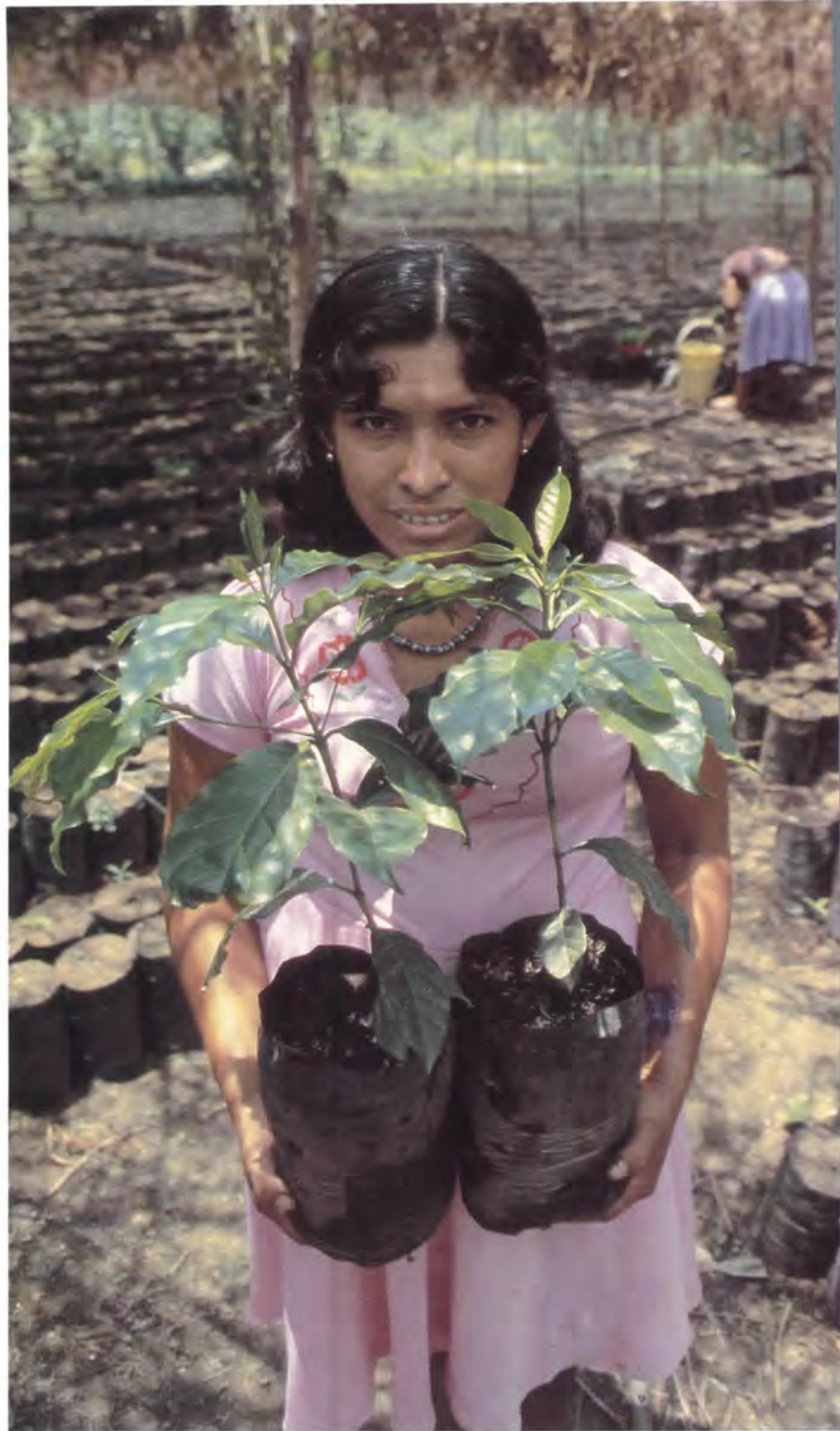
Worker (above) in Honduran coffee cooperative nursery holds new coffee plants ready to be transplanted in individual farms.

Another key is exports. In the view of many development experts, only the export market is likely to provide the impetus needed to spur rapid industrial growth. For its part, the U.S., through the CBI provision for duty-free access to its markets, is helping create a favorable environment for just such an export strategy. One estimate is that, with government encouragement, non-traditional exports from the Caribbean Basin could increase 20 percent by the end of the decade.