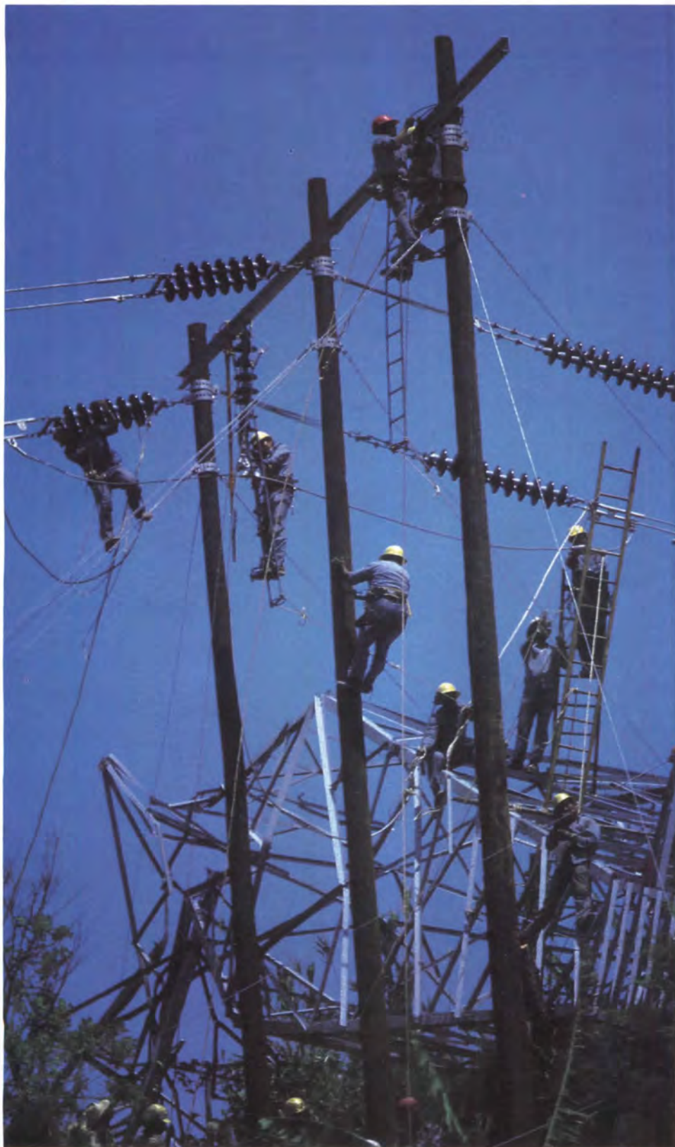
New wooden transmission poles installed by helicopter-borne repair crew replace steel tower demolished by guerrillas.

A lthough large-scale guerrilla operations in El Salvador have been reduced, the guerrilla campaign to foster economic and political instability by destroying the country's infrastructure—roads, bridges, power plants, etc.—continues with frustrating regularity. The success of El Salvador's National Plan—which includes the revitalization and stabilization of its economy—requires that such installations destroyed by the guerrillas be repaired or replaced and that public services be restored. A large part of AID's effort in El Salvador is dedicated to keeping basic public services operating so that the country can get on with the business of economic recovery. In addition to replacing towers with helicopter-borne repair crews, these projects include: —Emergency stand-by generators that are activated when the guerrillas try to cut off electrical power to whole sections of the country by destroying substations, as well as transmission towers. (The U.S. assumes the cost of this operation which can amount to as much as $100,000 a day.) —AID-funded "Bailey bridges," which provide temporary (and movable) replacements for bridges blown up by the guerrillas. □