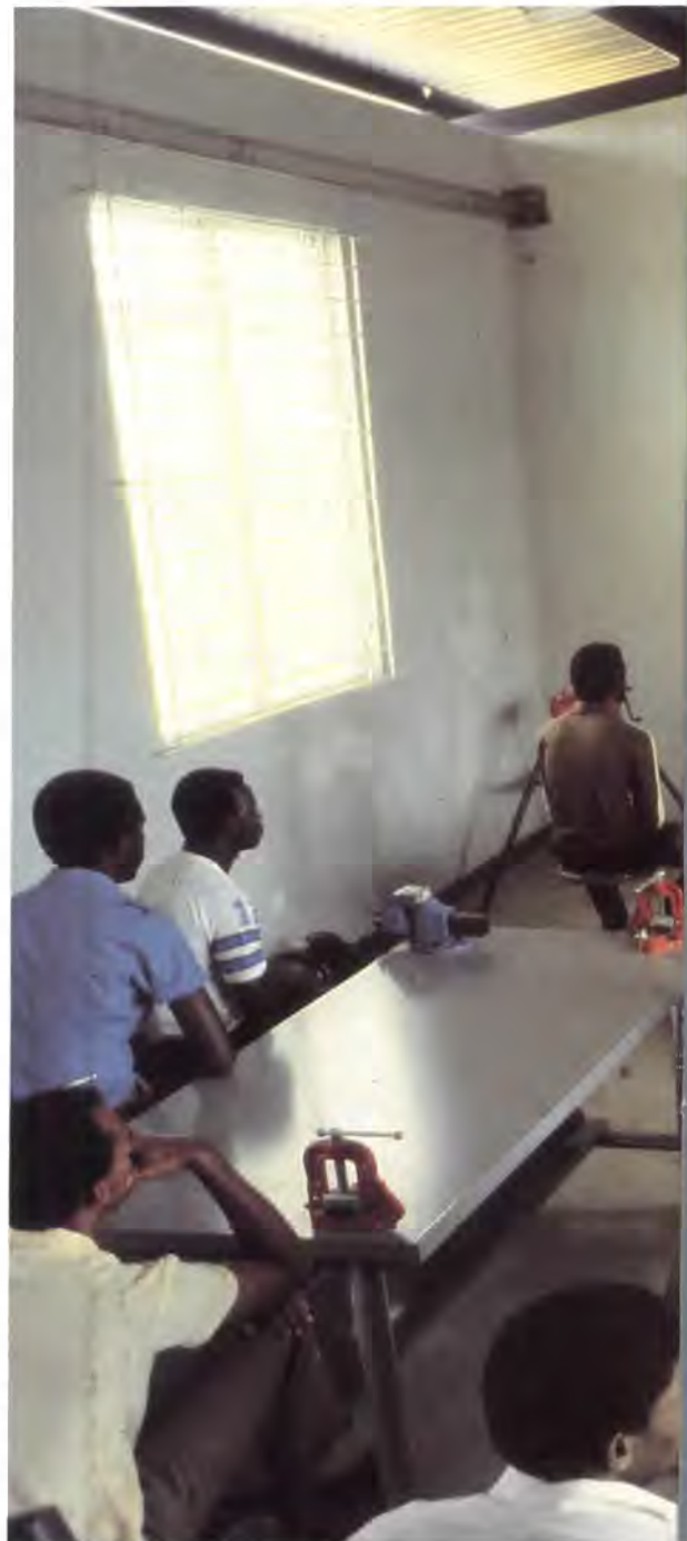
Pipefitting is one of several types of vocational training offered at Jamaica's Portmore H.E.A.R.T. Academy.

families. Under the HIG program, private financial institutions provide long-term financing for low-income shelter and for upgrading neighborhoods, including squatter settlements; The U.S. underwrites these transactions by protecting the U.S. lender against possible loss. Since the program's inception 20 years ago, AID has authorized a total of $1.81 thousand million to finance housing projects in 44 countries worldwide. For 1984-85, HIG programs have been conducted in 15 countries in the region: Belize, Costa Rica, El Salvador, Guatemala, Honduras, Jamaica, Panama, and the Caribbean island nations of Antigua and Barbuda, Domi-