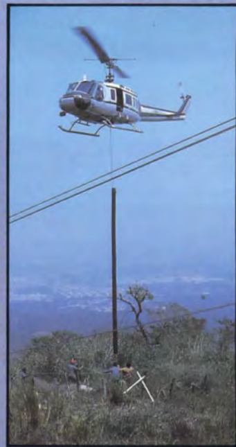
Helicopter installs transmission poles to replace those destroyed by guerrilla sabotage.

After the helicopter delivers the repair crew, it flies back with the new transmission poles suspended beneath it on cables. At the site, the helicopter becomes a flying crane as it lowers the poles into holes prepared by the repair crews. Once the poles are set firmly in the ground, the business of replacing the wires can begin. The program has proved so successful in restoring electrical service that the guerrillas have taken to shooting at the helicopters as they go about their work.