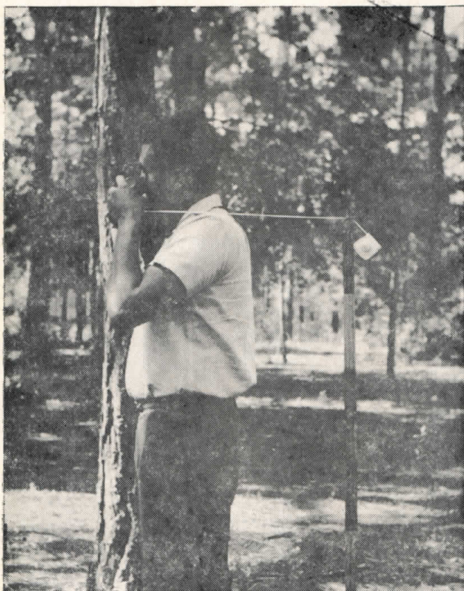
Figure 3.—Second Count or Point Center Extension. Note perforated tape attached to the staff and hole in horizontal position.