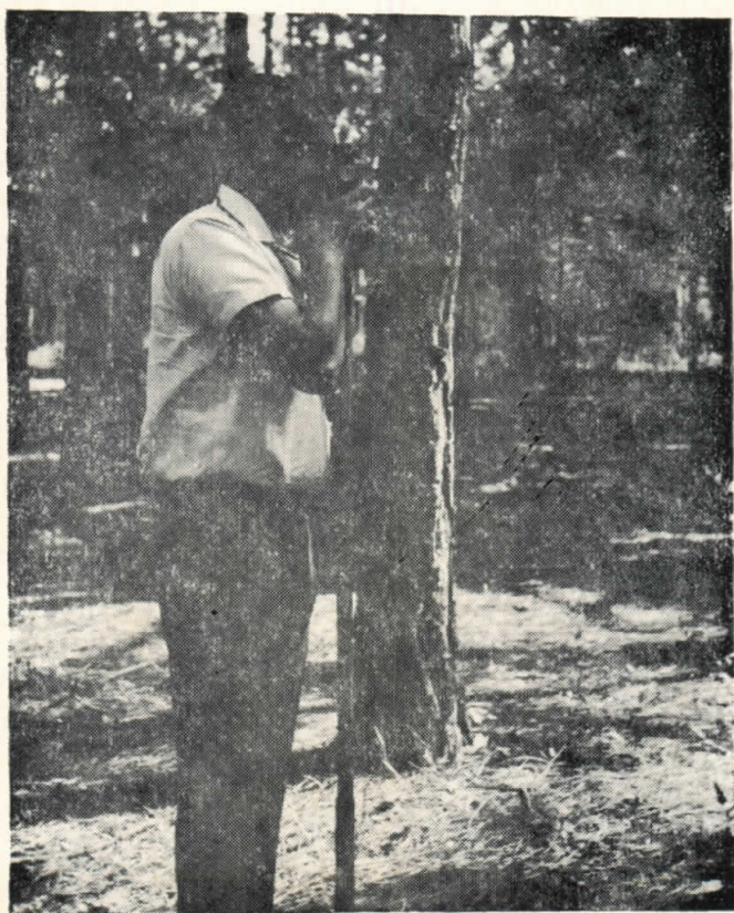
Figure 2.—First Count. Note staff to put the Spiegelrelascope at eye level.